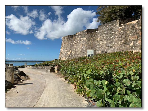
Seagrape is the dominant vegetation between the city wall and the Paseo.