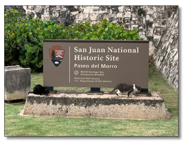
Cats eat from piles of kibble that were left on the base of the NPS sign at the entrance to the Paseo.

The cats of the Paseo are occasionally mentioned in travel blogs (e.g., Cruise Port Advisor [2020], My Cruise Stories [2018], Frommer's Media [2022]). During public scoping, some commenters claim that the cats are vital to tourism, and without the cats, tourism to Old San Juan and specifically the park would suffer. Conversely, some commenters believe that the presence of the free-ranging cats and feeding