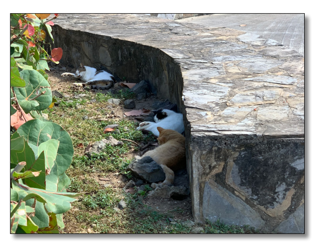
Three cats sleep in the shade provided by a low stone wall along the Paseo.