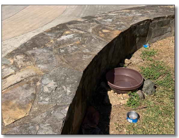
Cat food cans sit behind a low wall along the Paseo apart from the feeding stations.

The National Park Service conducted a visitor study in February 2010, distributing questionnaires in both English and Spanish to visitor groups throughout the park (Boyd and Hollenhorst 2011). Nearly 500 questionnaires were returned, providing insight into the preferences of the park's visitors. Many questions asked visitors to choose answers from a list of responses, often with an open-ended option ("other"), while others were completely open-ended. The questionnaire did not offer free-ranging cats as a response to any questions, but visitors included cats in their responses in several situations. Cats were identified as a topic that visitors would want to learn more about on future visits to the park. Cats were also mentioned as the element that visitors liked