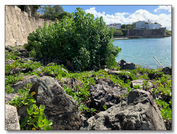
Vines and shrubs grow among the riprap adjacent to the Paseo.

boa, a federally endangered species under the ESA, has the potential to occur within the park, though it has never been observed there.