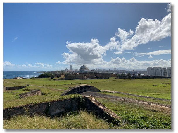
The landscape in the El Cañuelo area of the park consists of mainly mowed turf.