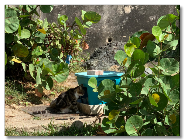
A cat at one of the feeding stations appears to be pregnant or recently pregnant.

TNR is most effective in a closed system, and an exceptionally high rate of individuals within a population needs to be sterilized for TNR to be successful (Jessup 2004). In a population that is not isolated, such as the one at the park, TNR is not effective. New cats come into the colony