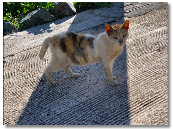
A cat stands in the shade of a lighting fixture on the Paseo.