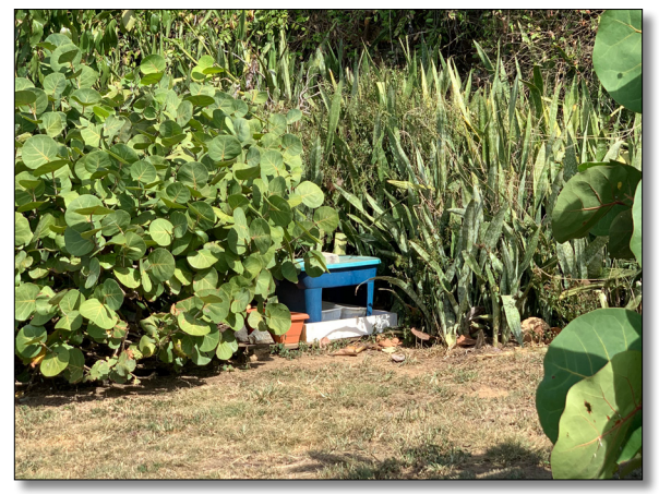
One of the feeding stations on the Paseo has two food containers inside of a covered plastic bin with a hole cut in the side for cats to enter. A container for water sits beside it.

A TNR program works to reduce free-ranging cat populations by removing kittens and socialized cats for adoption and stabilizing the remaining population by sterilizing cats, thus ending reproduction. Cats are live trapped, assessed by a veterinarian, spayed or neutered, vaccinated, and released to the location where they were trapped. While under sedation for the spay/neuter surgery, the tip of one of the cat's ears is removed so that altered cats can be easily identified as sterilized in the field (ear tip or tag). During the veterinary assessment, cats may be humanely euthanized due to health issues. TNR programs often involve the development of feeding stations because feeding the cats can help volunteers trap the cats and