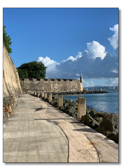
The Paseo del Morro National Recreational Trail is a 0.75-mile-long trail that provides visitors an opportunity to experience the natural resources of the park and view the fortification walls from the waterfront.

Currently, seven cat feeding stations are located along the Paseo. These feeding stations are managed by Save a Gato (SAG), a local non-profit organization that cares for the cats of Old San Juan (figure 2). Because of these feeding stations, the free-ranging cats are concentrated along the Paseo. They can be found on or near the Paseo near the fortification wall, often using the vegetation on either side of the path for shade and shelter. Therefore, cat management efforts would focus on the Paseo but could also occur in other areas of the park.