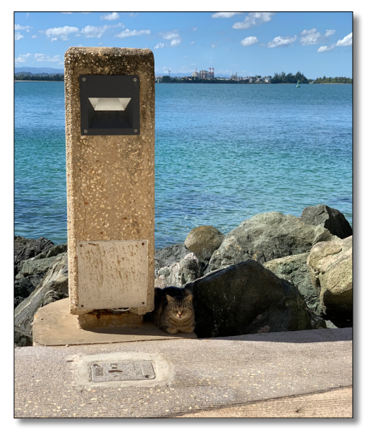
The Paseo del Morro National Recreational Trail, where the cats are concentrated, is adjacent to San Juan Bay.

The Endangered Species Act of 1973 (ESA), as amended, provides for the protection of rare, threatened, and endangered species. The National Park Service reviewed information available on the US Fish and Wildlife Service (USFWS) Information for Planning and Consultation (IPaC) system, which identified