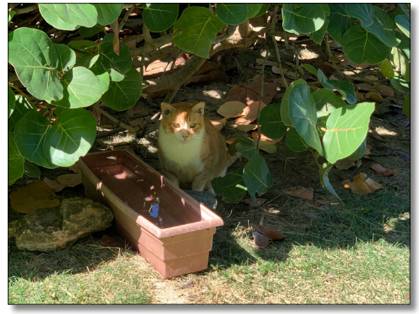
A cat uses a water trough provided at one of the feeding stations along the Paseo.

During site visits to the Paseo in January and November 2022, many cats were observed along the Paseo, resting in the shade provided by the vegetation and stone benches, using the feeding stations, and moving among the