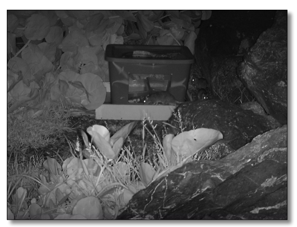
A photograph from the 2021 camera trap survey shows rats at one of the feeding stations.

The total number of cats and the number of pregnant/recently pregnant cats documented during the 2021 camera trap survey suggest that the TNR program is not working to reduce the cat population at the park. In 2005, the population was estimated to be 120 cats. The current population of nearly 200 cats may not be significantly larger, but the population is not decreasing, contrary to the objectives of the TNR program and NPS policies for management of invasive species.