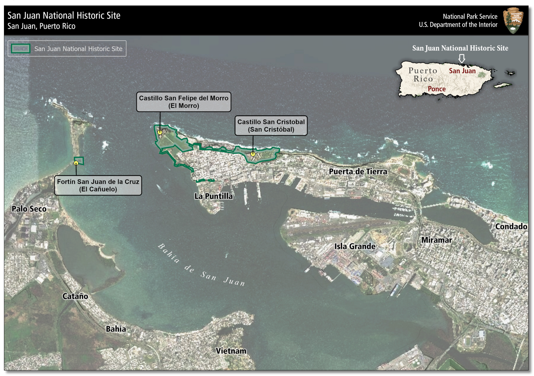
Figure 1. Location of San Juan National Historic Site