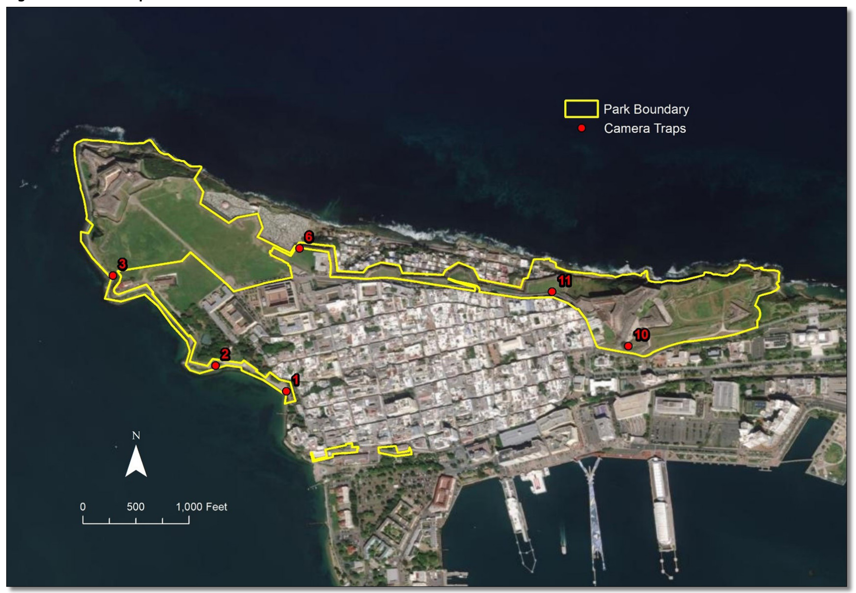
Figure 1. Camera trap locations.