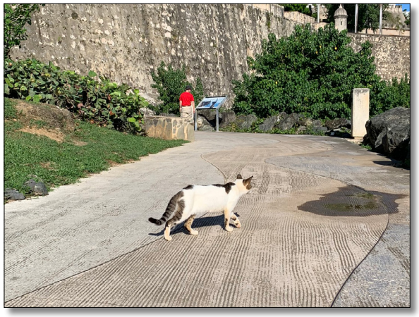
A visitor reads an interpretive sign in the background, and a cat crosses the Paseo in the foreground.

The park receives an average of 1.2 million visitors per year (NPS 2023); however, visitation estimates do not account for visitors to all park areas. Visitors to El Morro and San Cristobal are directly counted, but because visitors can access the park grounds (the 23-acre grassy area located in front of El Morro is popular with visitors for picnicking and kite flying) in multiple locations, the park does not have an accurate way to count those visitors. Visitors to the park