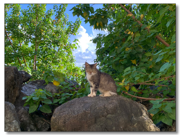
The free-ranging cat is an invasive species in any habitat.

In 2003, the US Department of Agriculture Animal and Plant Health Inspection Service (APHIS) Wildlife Services completed the Management of Feral and Free-Ranging Cat Populations to Reduce Threats to Human Health and Safety and Impacts to Native Wildlife Species in the Commonwealth of Puerto Rico Environmental Assessment with cooperation from the National Park Service. APHIS signed a Finding of No Significant Impact for this effort in December 2003 (USDA 2003). The environmental assessment (EA) analyzed alternatives for managing discrete free-ranging