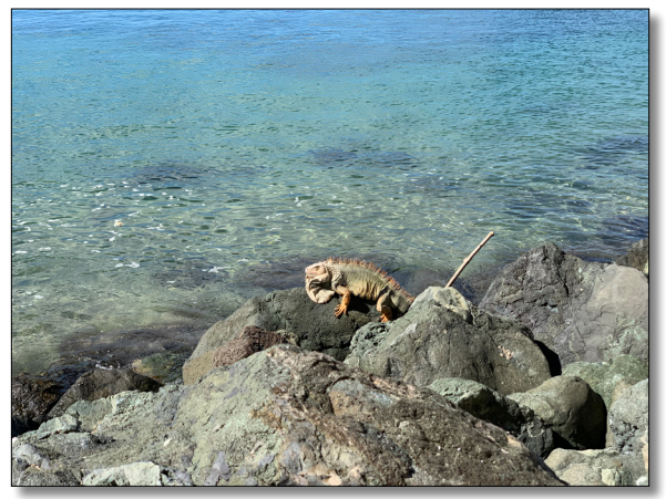
Green iguanas are abundant in the habitats along the Paseo.

During public scoping for this project, rats and iguanas are two invasive species of concern noted by commenters. Although iguanas are conspicuous on the landscape, rats are generally nocturnal. The 2021 camera trap survey captured both rats and iguanas eating from the feeding stations provided for the free-ranging cats. As noted in chapter 1, rats were only observed eating from the station just inside the San Juan gate (station #1, see figure 2), indicating that the rats are likely coming to the Paseo from the city of Old San Juan to eat the food. Iguanas were only observed at feeding station #3, which is in direct sunlight; the rest of the stations are in shaded areas, which is not preferred habitat for iguanas. This indicates that the supplemental food is benefiting invasive species other than cats, though this benefit may be limited. It should be noted that there are limitations to the observations made during the survey, as not all of the feeding stations were monitored.