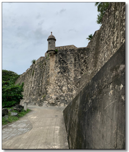
The fortifications and city walls are contributing elements to the cultural landscape at the park.

The results of the 2021 camera trap survey show that the freeranging cats in the park are concentrated along the Paseo, which is immediately adjacent to the shoreline. Although no site-specific studies on water quality have been performed, cat waste is likely affecting San Juan Bay. T. gondii not only affects terrestrial species, it also infects aquatic species, including manatees and sea otters (Bossart et al. 2012; Miller et al. 2004; Miller et al. 2023; Conrad et al. 2005; Mazzillo et al. 2013). As T. gondii is shed by cats, it