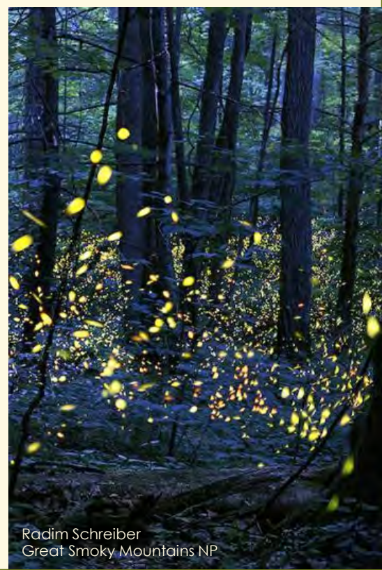
Great Smoky Mountains NP