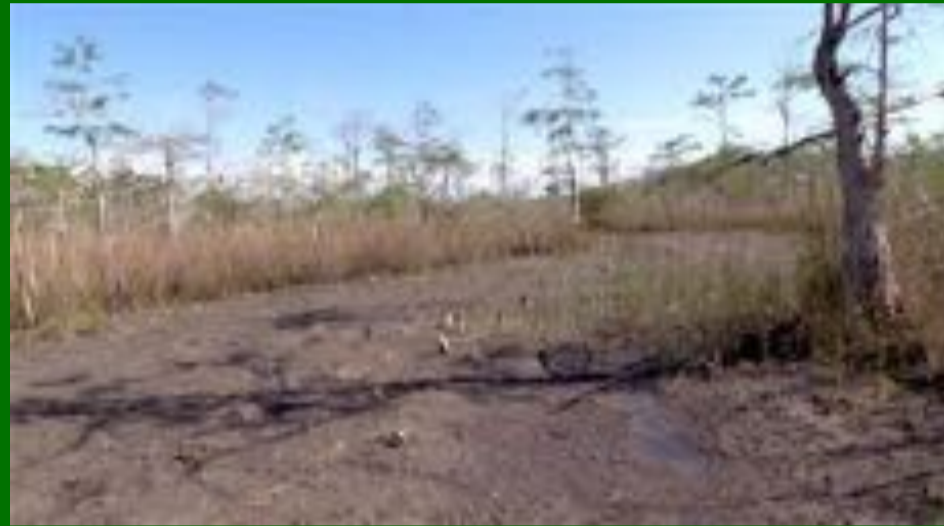
Big Cypress National Preserve, March 2020

This series of stories in March 2020 was developed after a field trip to Big Cypress by Editor-in-Chief Kurt Repanshek and Contributing Writer Kim O'Connell. Along with reporting on visible impacts to Big Cypress from oil exploration dating back to 2017, the trip provided coverage of the U.S. Army Corps of Engineers' flipflop on whether Burnett Oil Co. had damaged the park's resources.