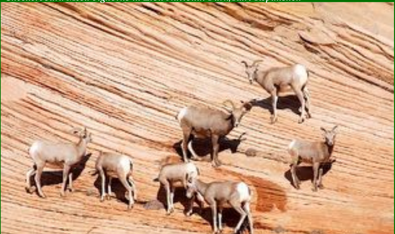
Checkerboard Mesa bighorns in Zion National Park

Through June 30, 2020, nearly 93,000 episodes were downloaded, with listeners from at least 50 countries.