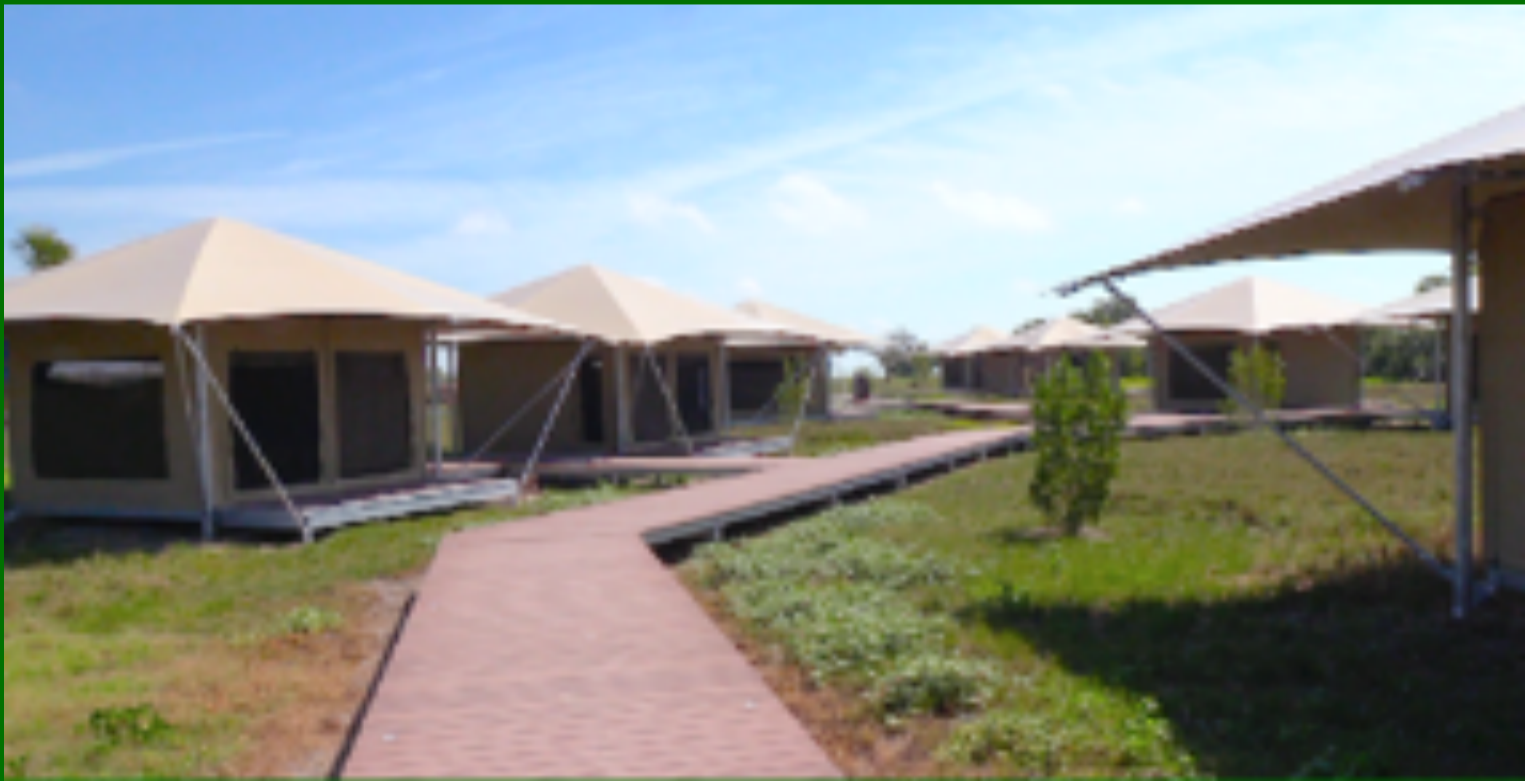
Twenty "eco-tents" are the first phase in expanded lodging at Flamingo in Everglades National Park

Smudge pots weren't in sight when I visited Flamingo on the southern tip of Everglades National Park, but it was early spring and the mosquitoes hadn't quite worked themselves up to scourge strength. They are legendary when in full biting force, with rumors of cows and mules being killed by vicious, insatiable swarms of the bloodsuckers. And yet, the appeal of Flamingo to anglers and those fleeing winter's snows for a few days makes it a popular destination.~ Kurt Repanshek