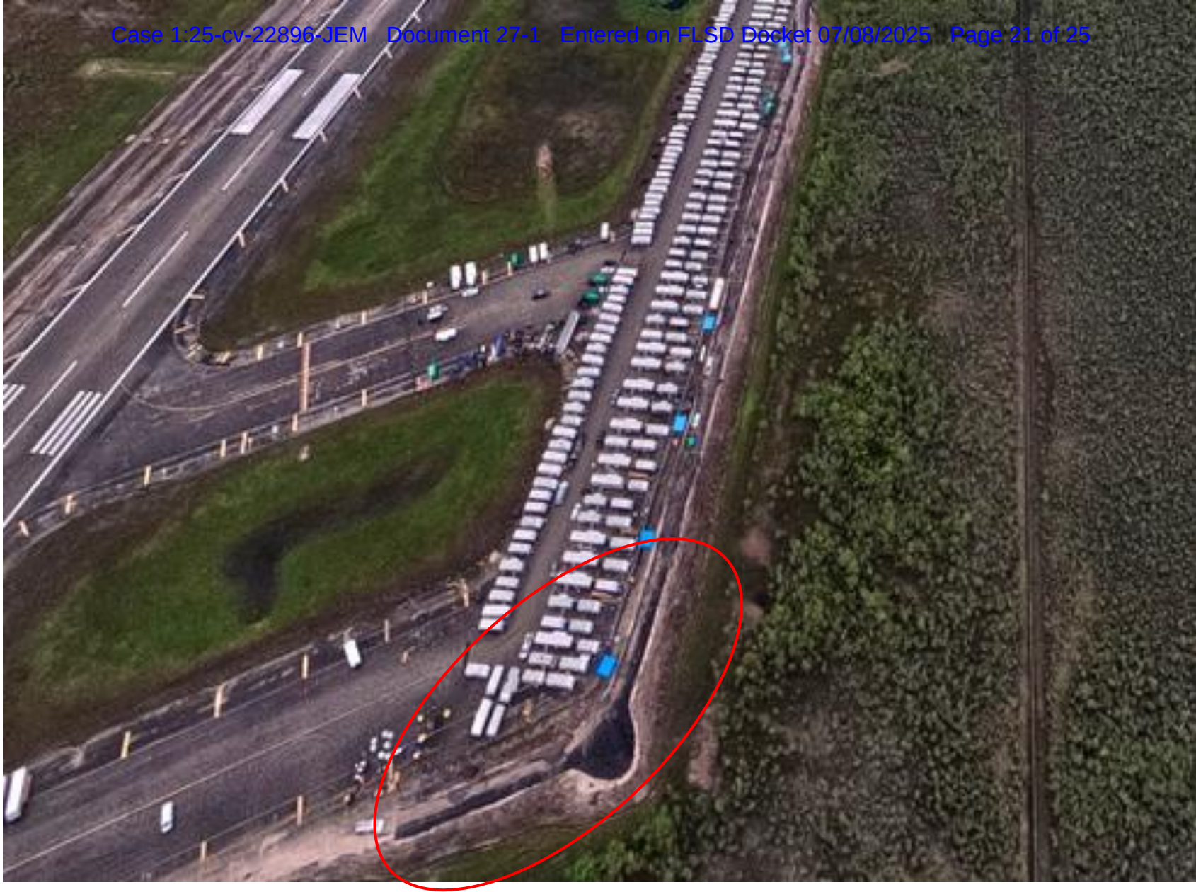
Detail of Photo 3, Looking W. New road, turnaround and asphaltting of same at east end of taxiway.