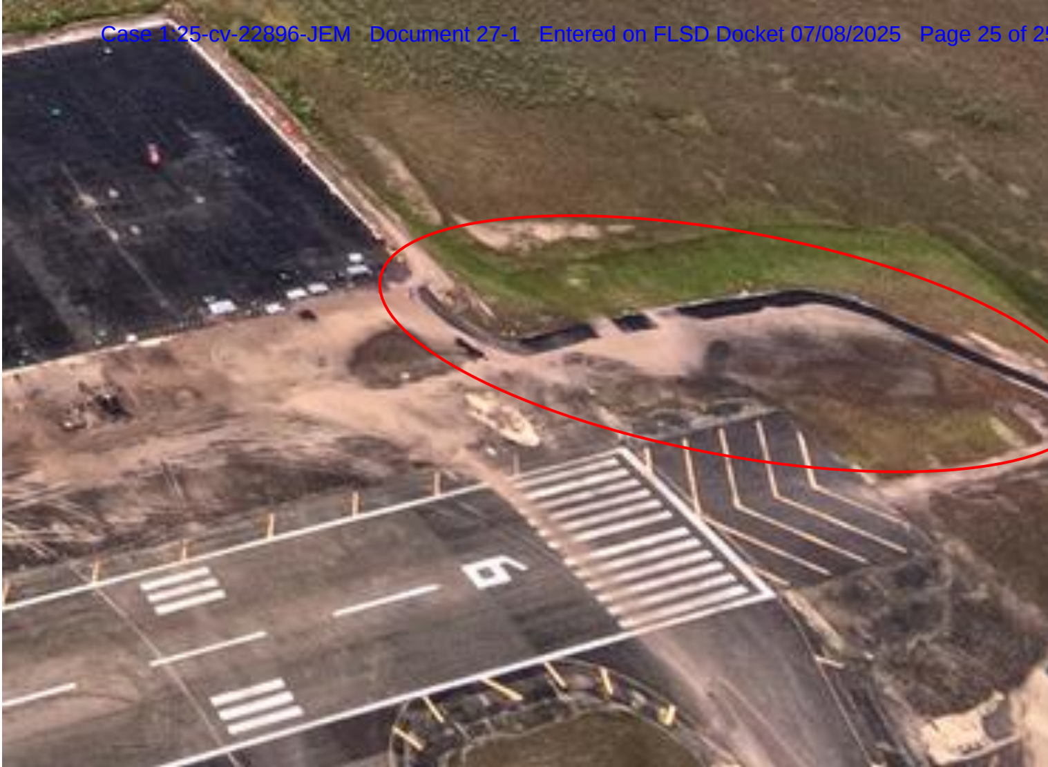
Detail of Photo 23, looking S. Western portion of newly paved entrance road from main N-S entrance road.