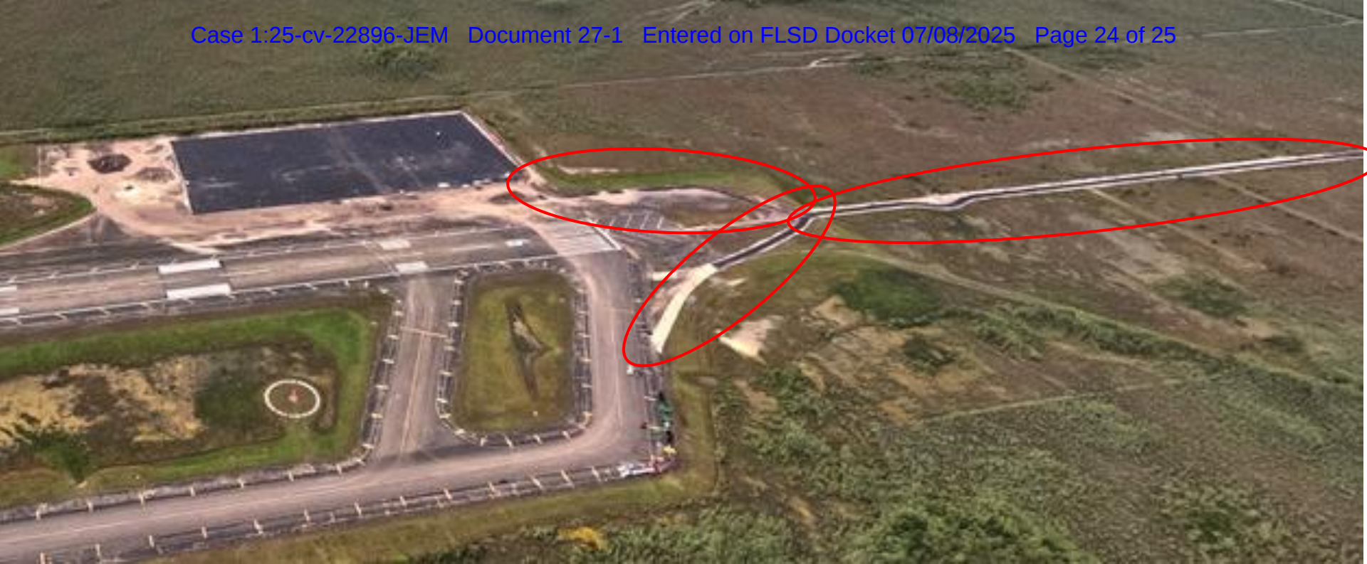
Detail of Photo 22, looking S. Western portions and “Y” split of newly paved entrance road from main N-S entrance road.