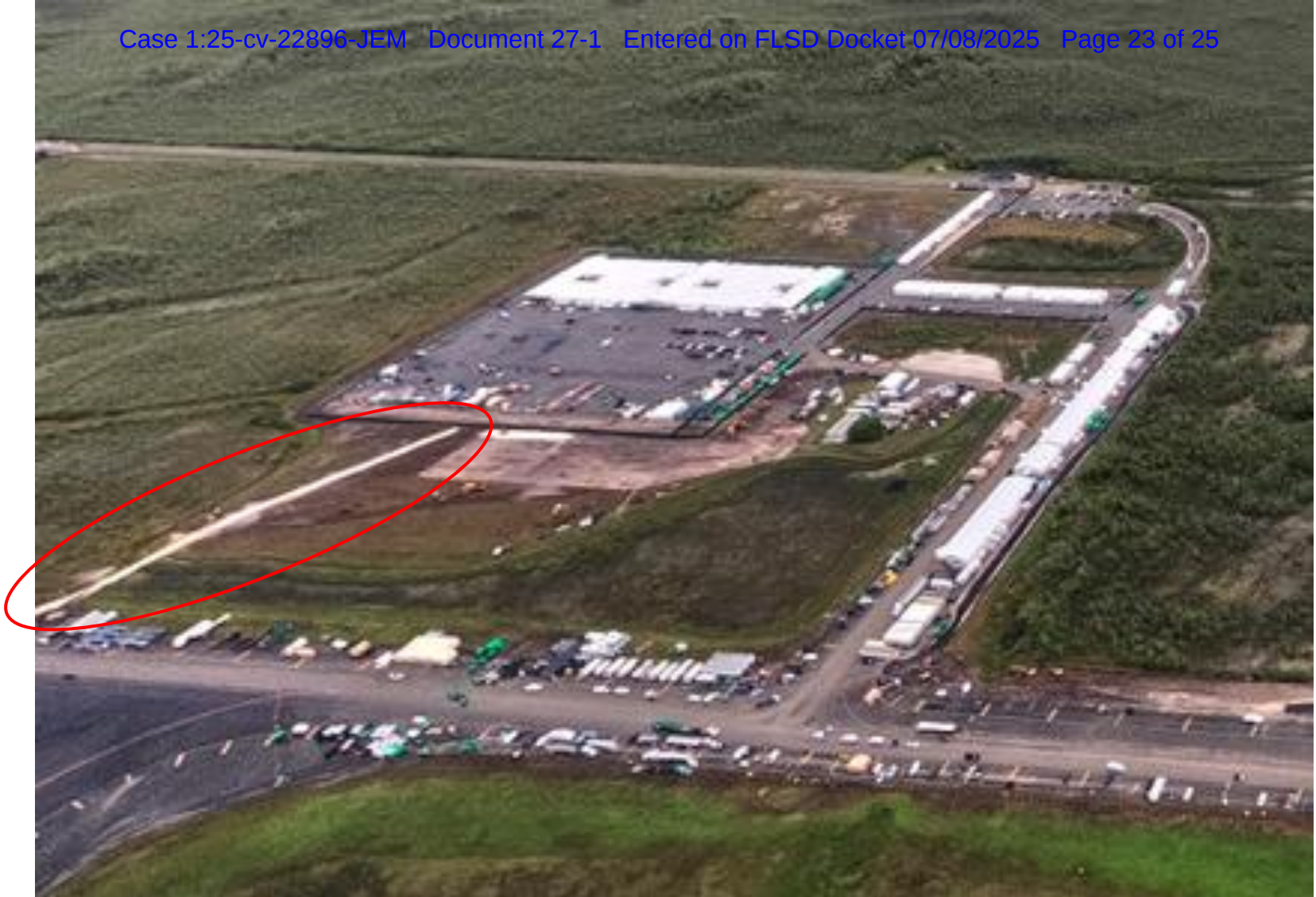
Detail of Photo 18, Looking N. White diagonal line on LHS is new road, not yet asphalted.