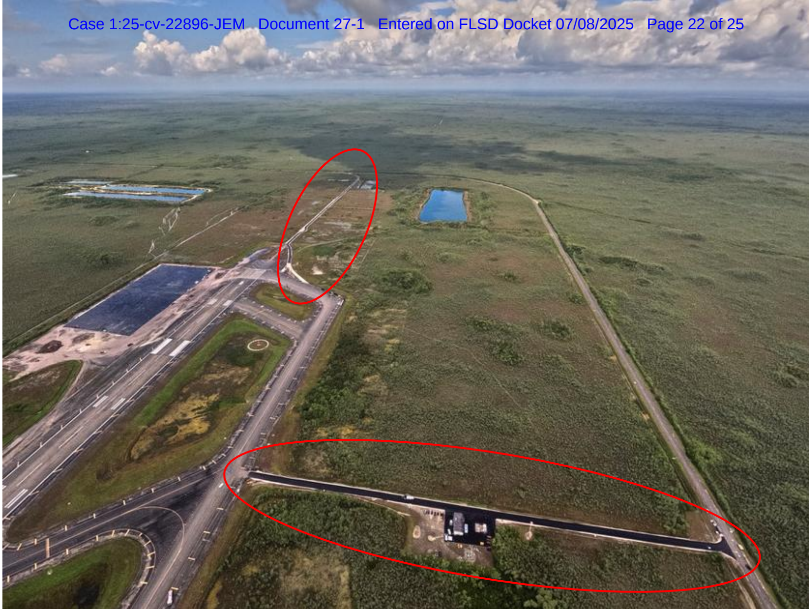
Detail of Photo 11, Looking W. Two areas of new road and asphaltting.