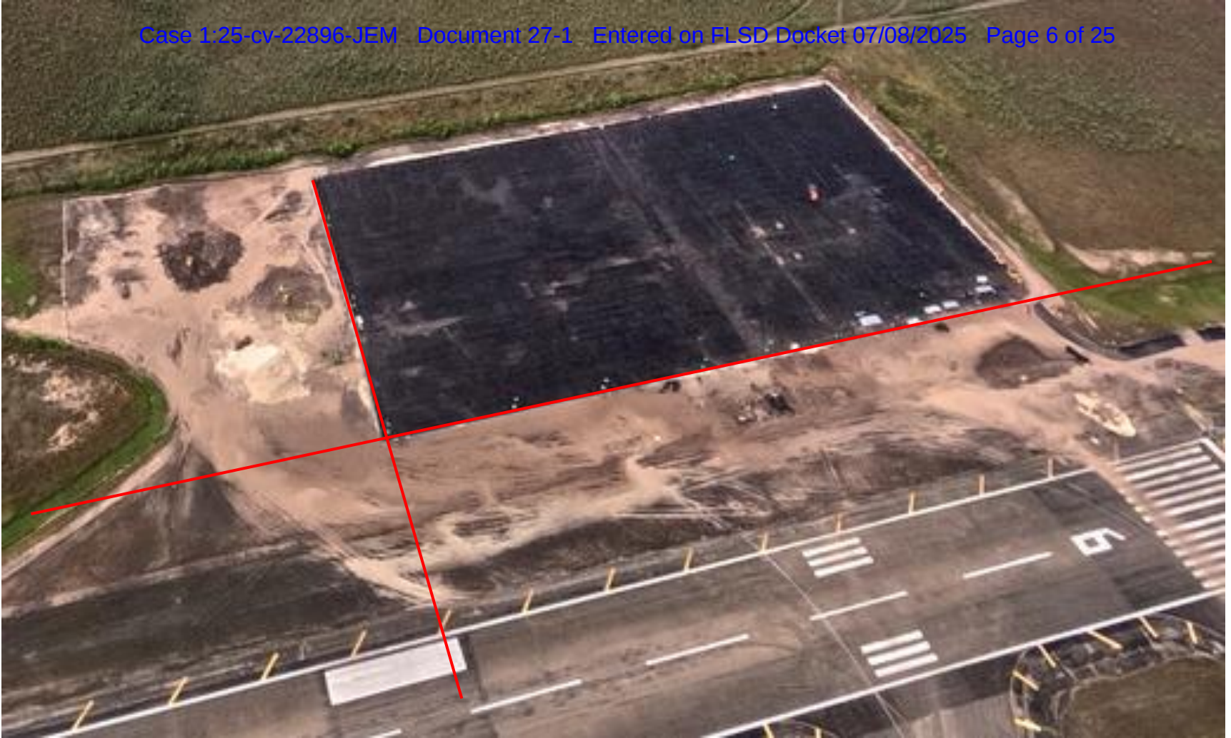
Detail of Photo 23.

Dark rectangle is new construction (compare with June 2025 Google Earth satellite imagery). Dark is almost certainly asphalt. Light sandy brown area to east and north of asphalt is newly scrapped area. Red alignment lines were used to estimate extent of assumed paved area (next slide).